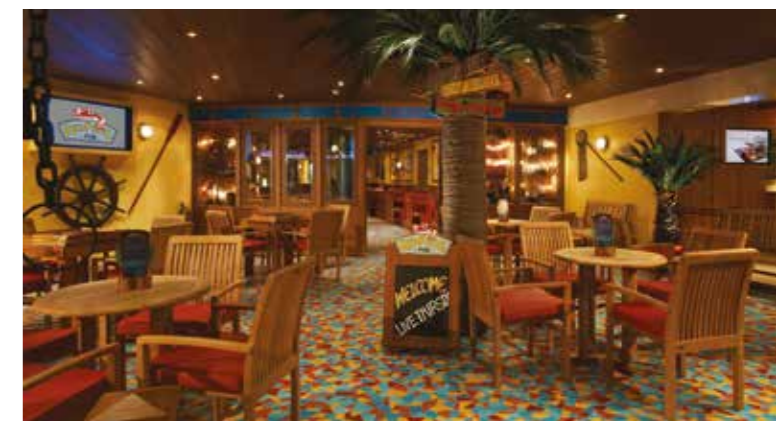
Red Frog Pub

Don't know the rules? Don't worry – our casino staff will help you get the basics. It's all exciting, even if you choose just to watch.