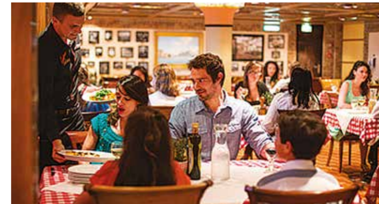
Cucina del Capitano