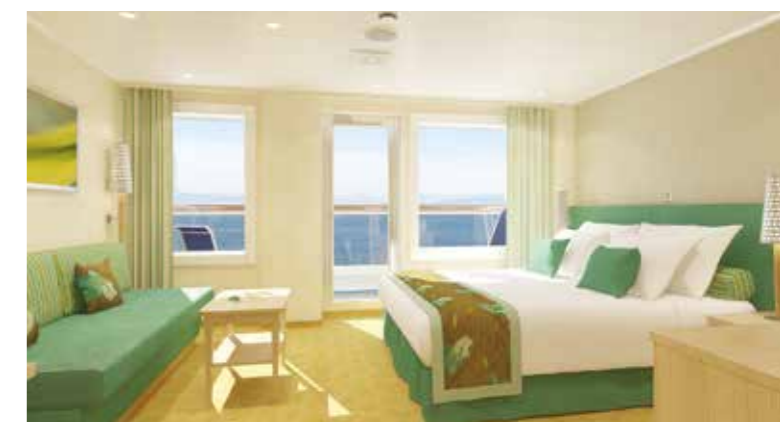
Cloud 9 Spa Suite