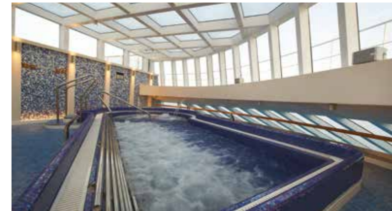
Cloud 9 Spa - Thalassotherapy Pool