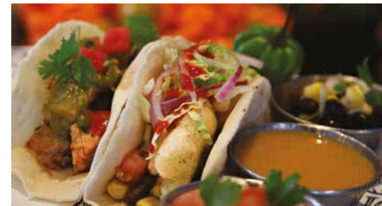
Blue Iguana Cantina