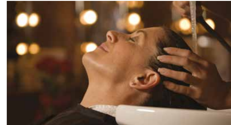
Hair & Beauty Salon

If you'd like to relax and retreat throughout your cruise, you can upgrade to a Spa Stateroom so you'll always be within easy reach of our spa facilities. From our thalassotherapy pool and sauna to relaxing treatments and beauty therapy.