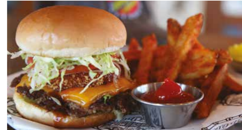
Guy's Burger Joint