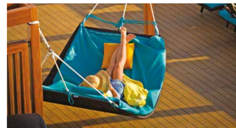
Serenity Adult Only Retreat

*Note: Features vary by ship. Before booking, please check online or with your travel agent to see what's on your particular ship.