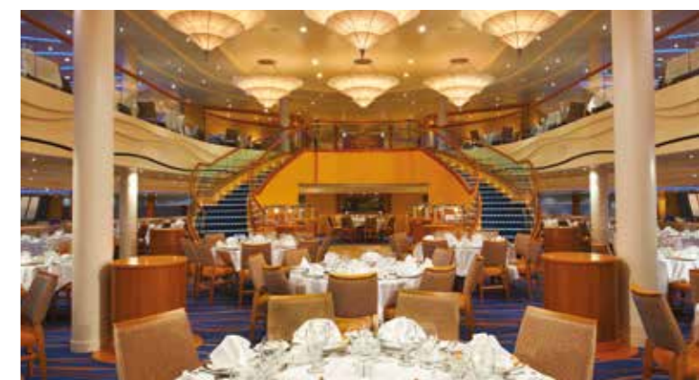
One of our Main Restaurants